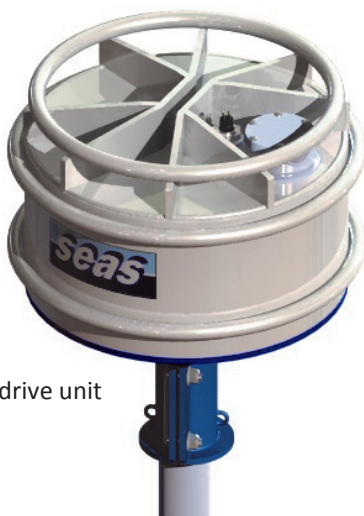
VC-450 drive unit

Its light weight modular design makes the VC-450 vibrocorer ideal for use on small vessels, enabling coring in very shallow water, estuarine, nearshore, lake and swamp environments as well as deeper water.